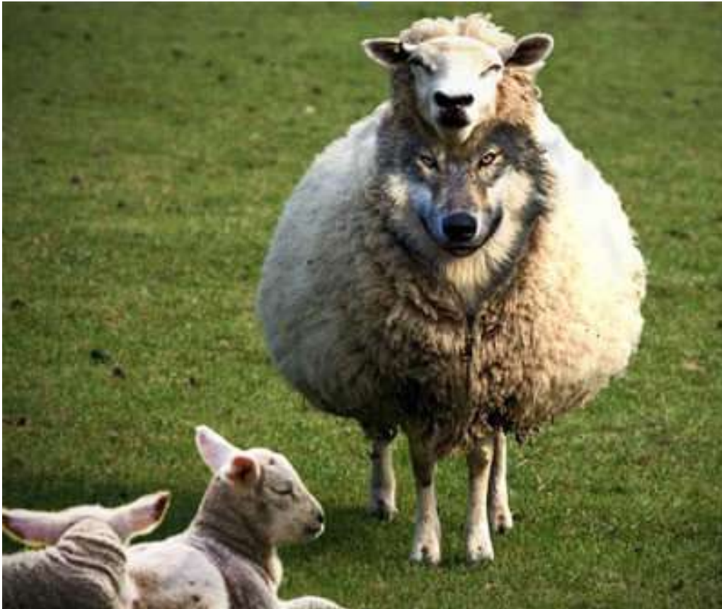
The Wolf in

[caption id="attachment_9845" align="alignright" width="512"]