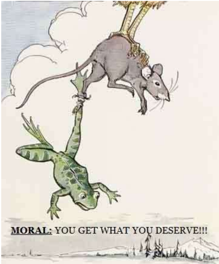
The Frog and the Mouse

[caption id="attachment_9853" align="alignnone" width="366"]